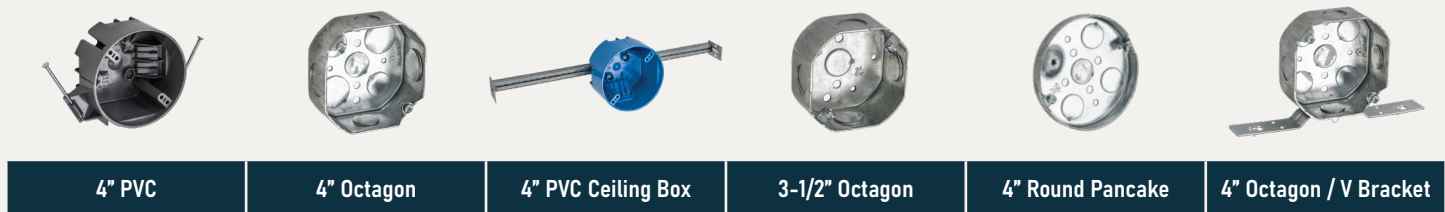
4" PVC 4" Octagon 4" PVC Ceiling Box 3-1/2" Octagon 4" Round Pancake 4" Octagon / V Bracket