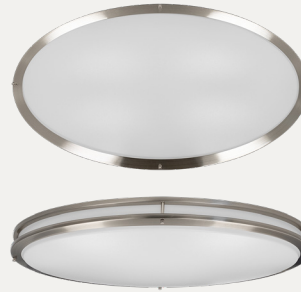
BN- Brushed Nickel