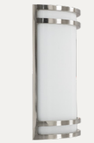
BN- Brushed Nickel